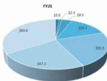
Revenue by Source (Dollars in Millions)

The following is a comparative graphic illustration of revenues by source (both operating and non-operating) for the years ending June 30, 2021, 2020 and 2019, which are used to fund the University's ongoing activities. As the following charts indicate, tuition and state appropriations remain the primary sources of funding for the University's academic programs. It should be noted that significant recurring sources of the University's revenues, including state appropriations, are considered non-operating revenues.